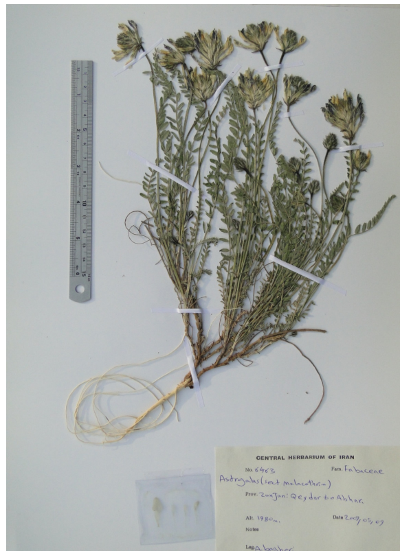
Fig. 2. Astragalus neo-iranshahri : Habit.