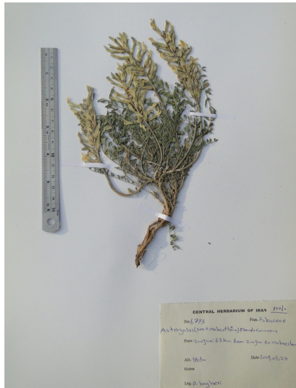
Fig. 3. Holotype of Astragalus pseudocomosus (after A. Bagheri 6793).