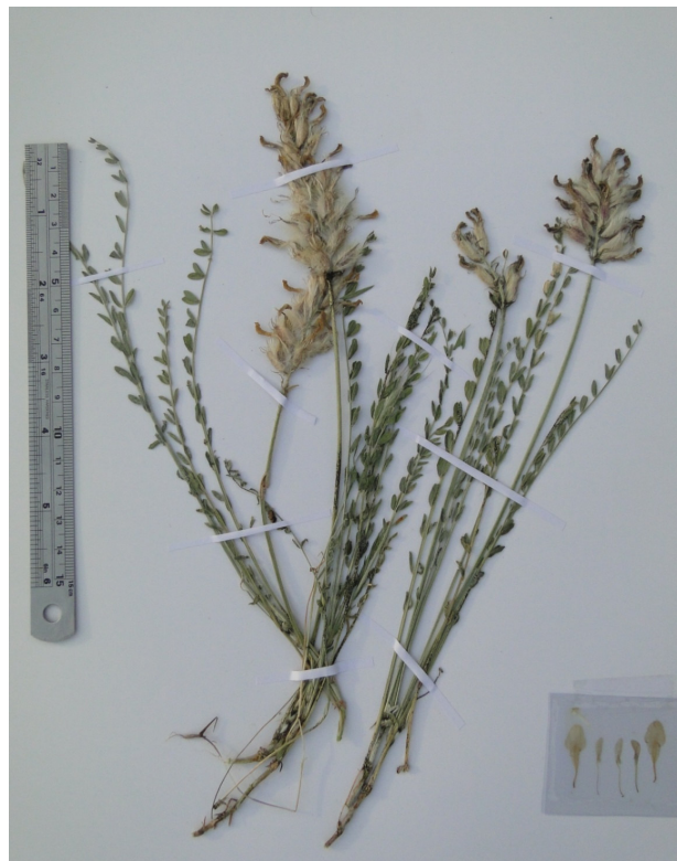
Fig. 4. Holotype of Astragalus subaspadanus (after A. Bagheri 32).