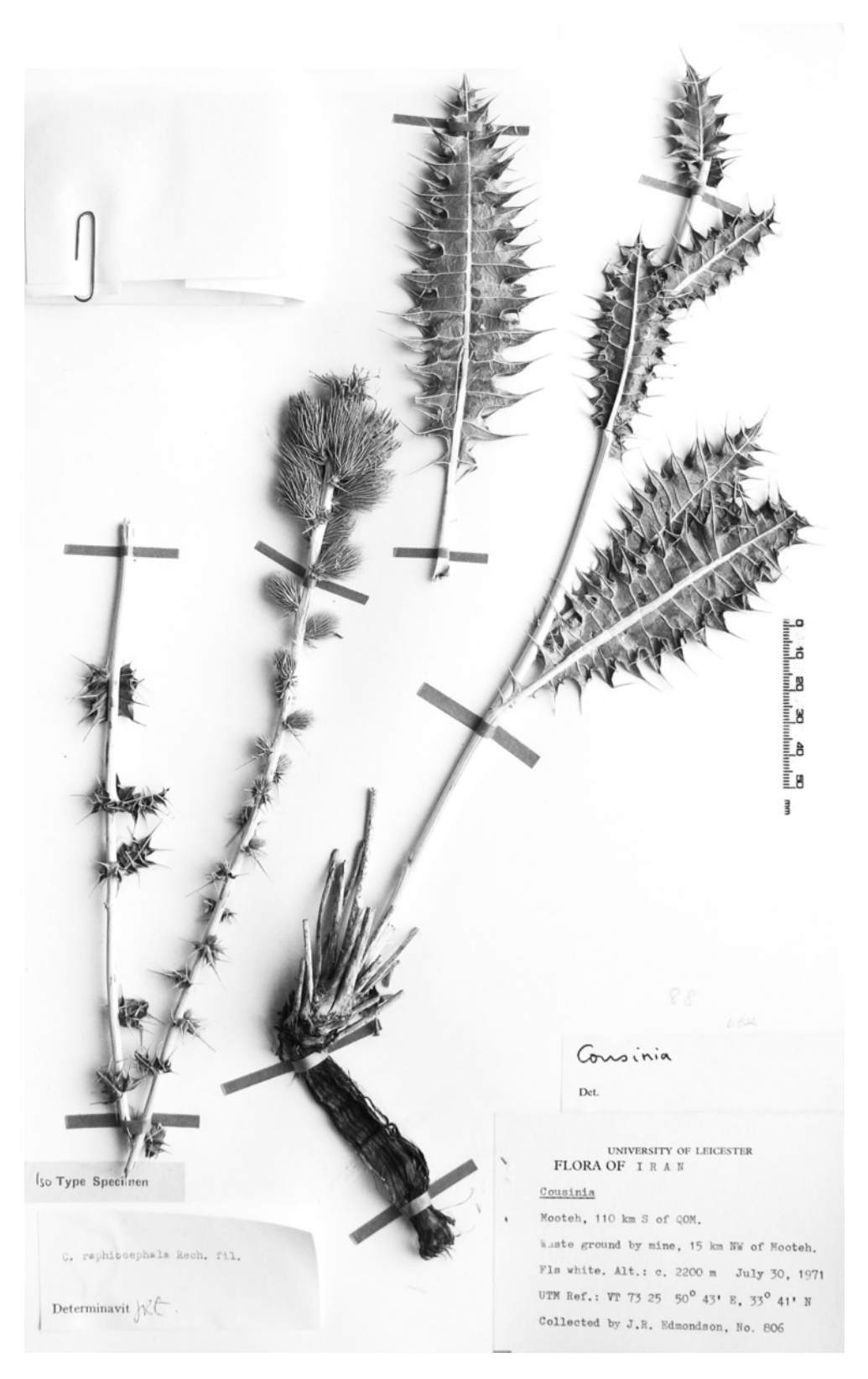
Fig. 3. Isotype of Cousinia raphiocephala (Edmondson 806, E).