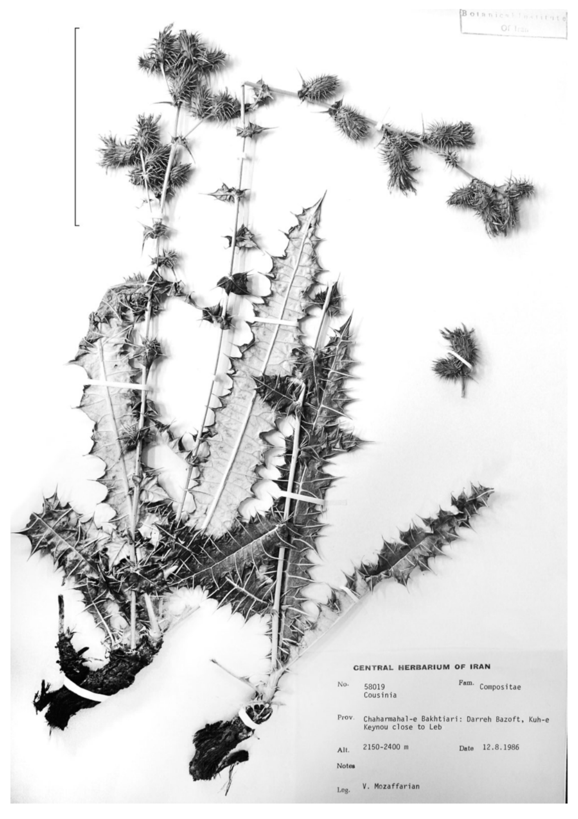
Fig. 5. Holotype of Cousinia curvibracteata (Mozaffarian 58019, TARI).