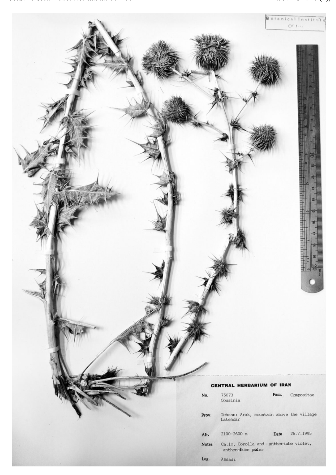
Fig. 2. Image of Cousinia hergtiana (Assadi 75073, TARI).