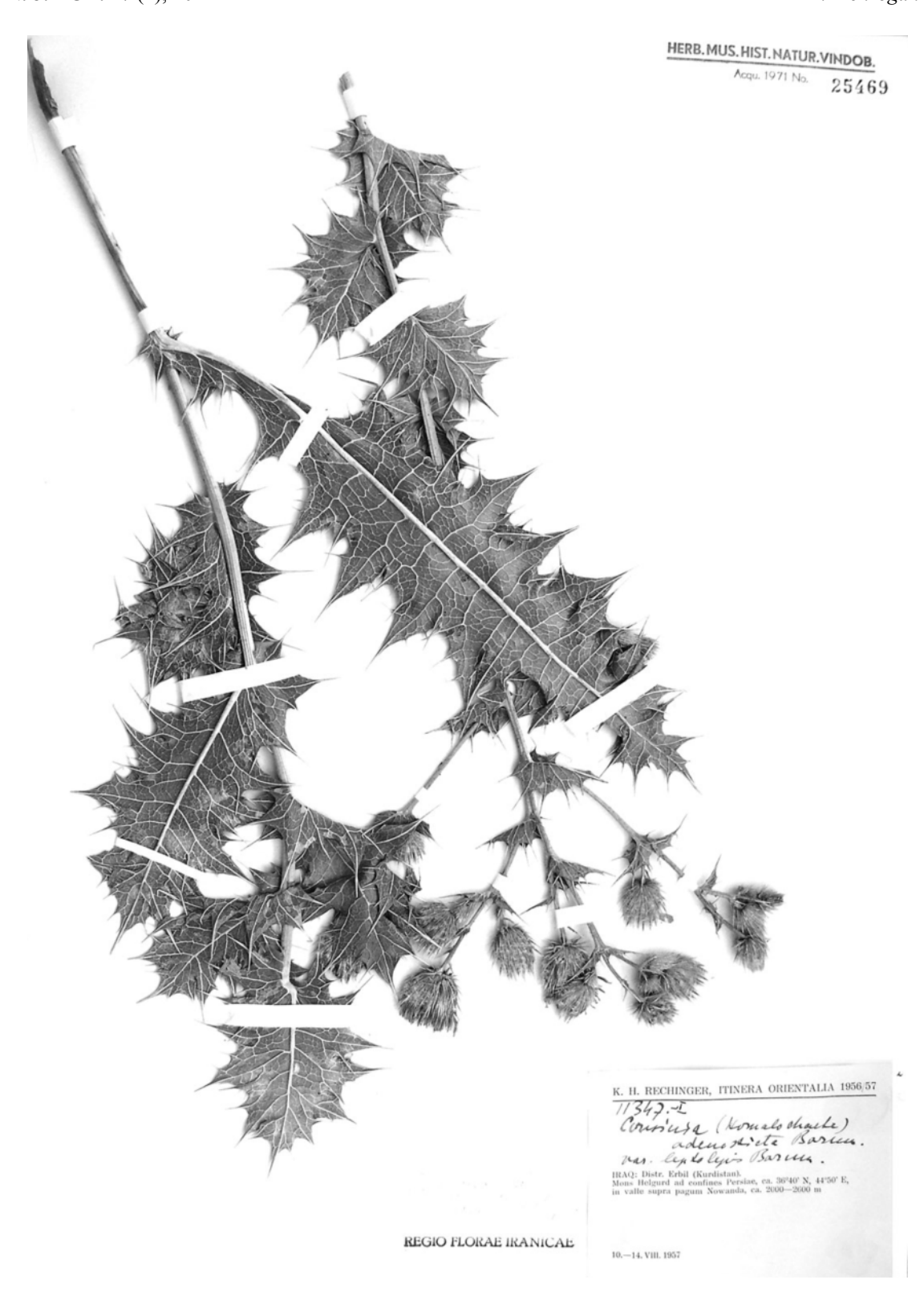
Fig. 6. Holotype of Cousinia rawanduzensis (Rechinger 11347-I, W).