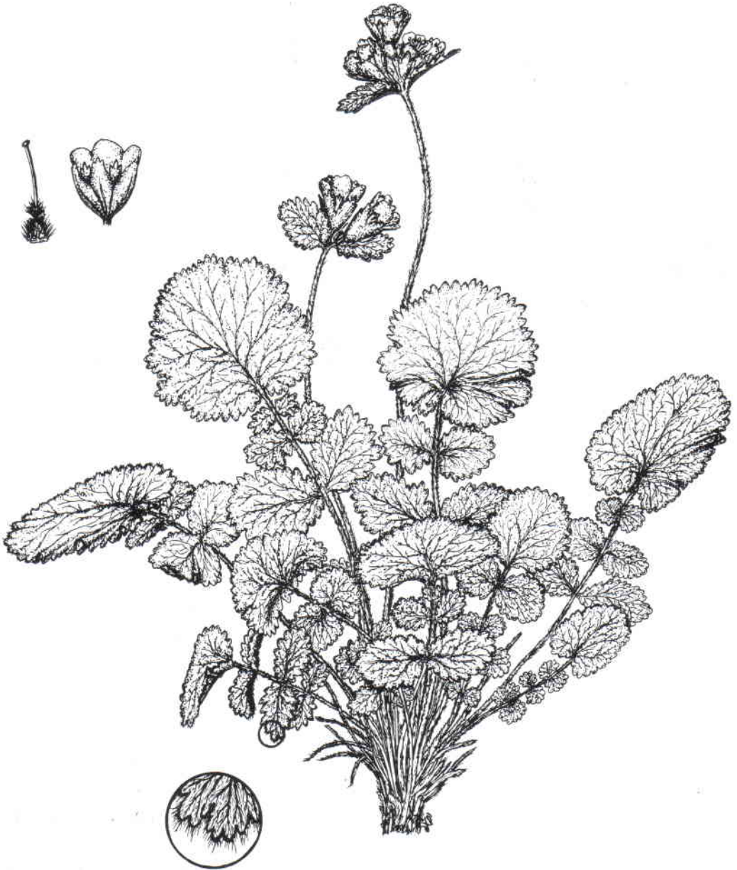
Fig. 1. Geum iranicum (x 0.8; flower x 1.5; young fruitlet x 3.3).