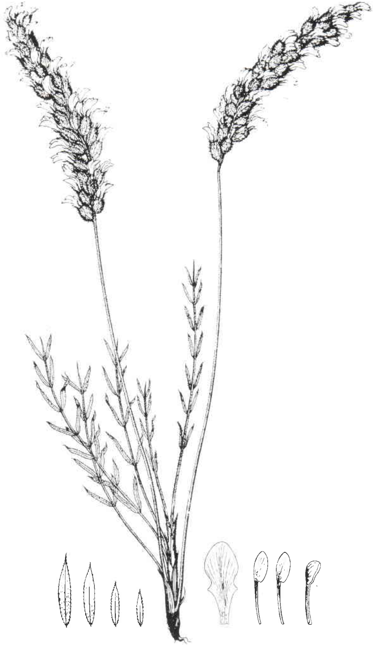
Fig. 1. Astragalus diant-nejadii (x 0.45; standard, wing, keel and leaflets x 0.9)