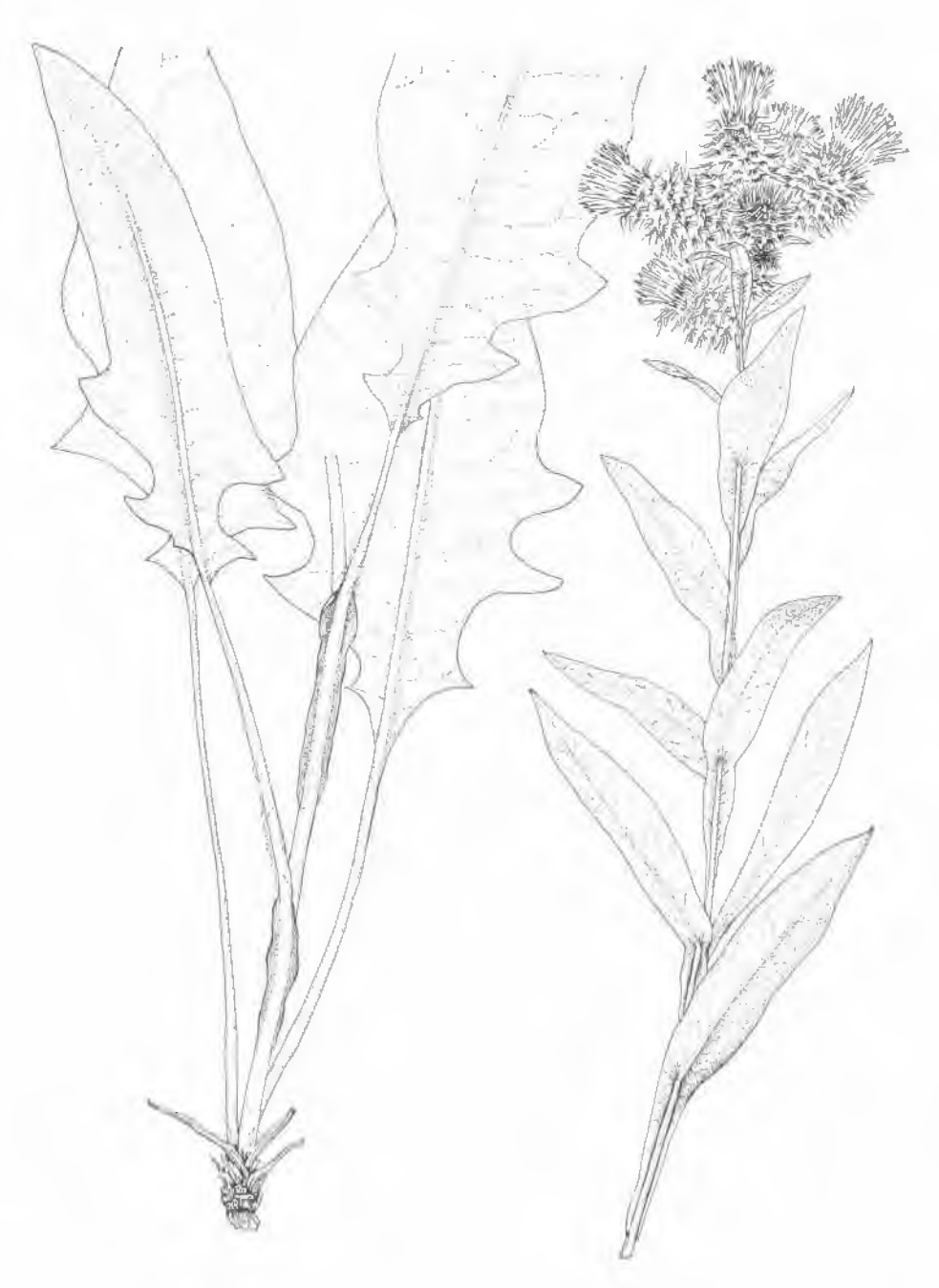
Fig 1. Centaurea phlomoides (x0.6).