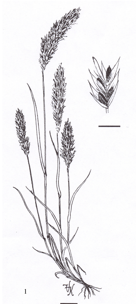
Fig. 1. Sori of Tilletia rostrariae Vánky & Ershad in the ovaries of Rostraria cristata (L.) Tzvelev (type). Habit of an infected plant with four panicles. Enlarged some spikelets with sori. Bars = 1 cm for habit, and 3 mm for the detail drawing.