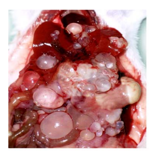
Figure 1. Treated group with albendazole. None of mice had viable hydatid cysts in internal organs (Above). Hydatid cysts in internal organs of mice in control group (Below).

Group 4, animals which were treated with mebendazole for 24 days, just one cyst was observed on the liver of mice. In control group (Figure 1) a high number of cysts were observed in