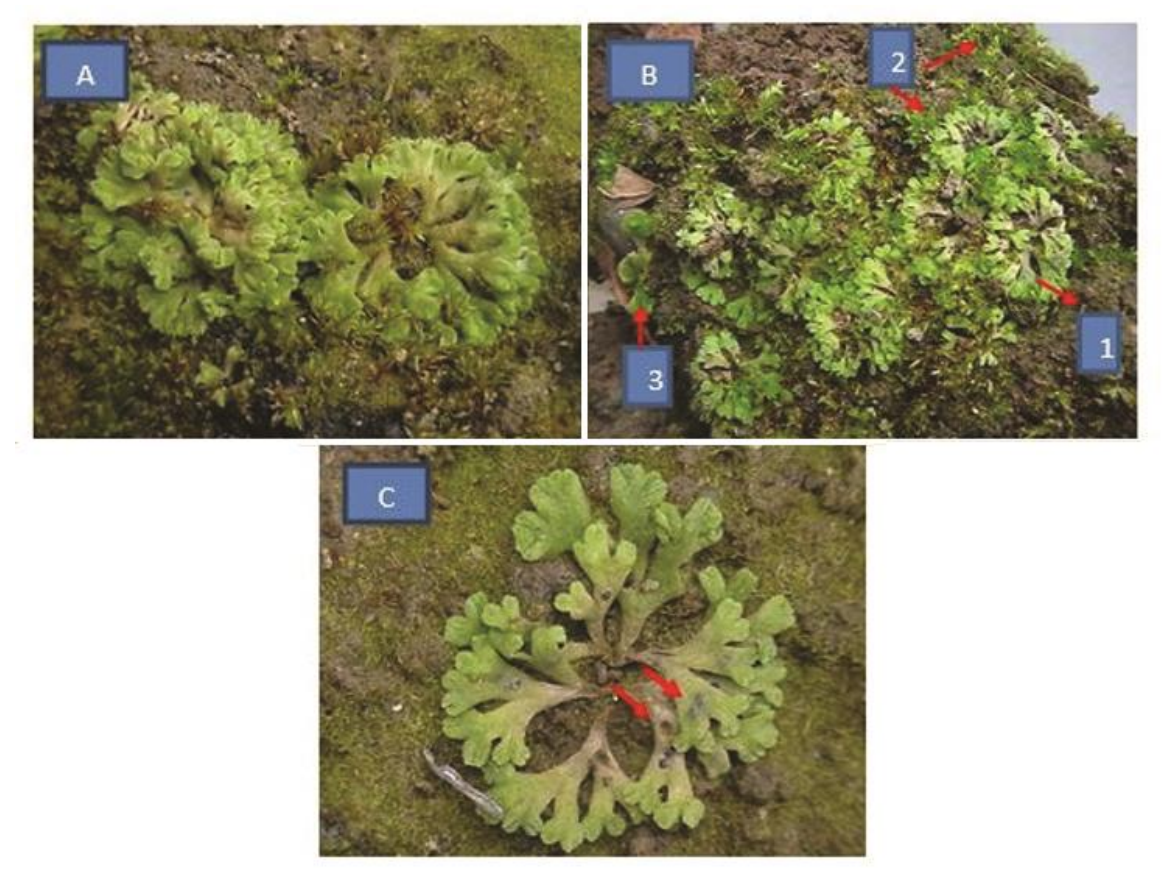
Fig. 1. A, Riccia pseudo-frostii as dichotomique and discoidal rosette (×40); B, association, (1) Riccia pseudo-frostii , (2) Funaria sp. , (3) Marchantia polymorpha (×20). C: decapsulated old basal parts of thallus (red arrow) (×60).