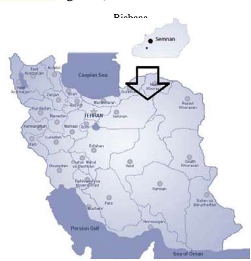
Figure 1. The locality where the fieldwork was carried out in Semnan province, Iran

In July 2012, 163 ticks were collected from two onehumped camels in a rural area of Semnan, Iran. Biyabanak is situated in South-West of Semnan, a hot and dry area (average maximum and minimum temperatures at sampling time were 39.9 \,^{\circ} C and 27 \,^{\circ} C, and its geographical coordinates are 35 \,^{\circ} 24' 41" North, 53 \,^{\circ} 16' 1" East; Figure 1).