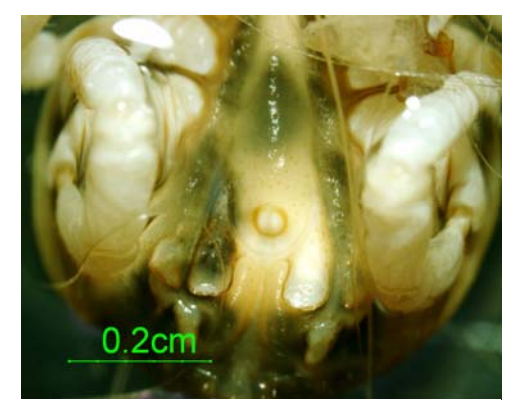
Figure 2. Subanal plate's alignment in H dromedarii (20×)

The collected ticks comprised of 94 adults (48 males and 46 females) and 67 nymphs of Hyalomma species. Almost all the adult ticks were running on the camel's wool and were not engorged, and their body colour varied from light to dark brown. Nymph ticks were engorged or engorging and were molting (Figures 3, 4).