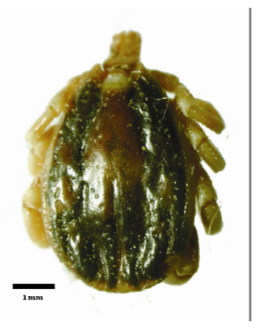
Figure 3. Four posterior ridges in the posterior region of the scutum of male H. dromedarii (15×).

detritumdetritum and Hyalomma detritumscupense in having four posterior ridges on the scutum (Figure 3).