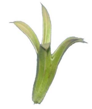
Fig. 2 Leaf