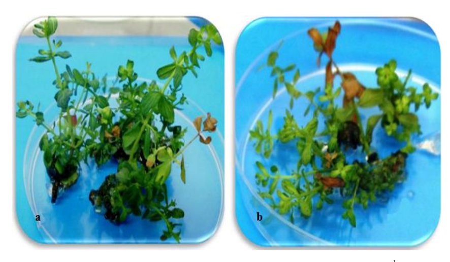
Fig. 2 The effect of chitosan on in vitro shoot growth of Hypericum Perforatum L. ;a) 250 mg L<sup>-1</sup> chitosan; b) control.