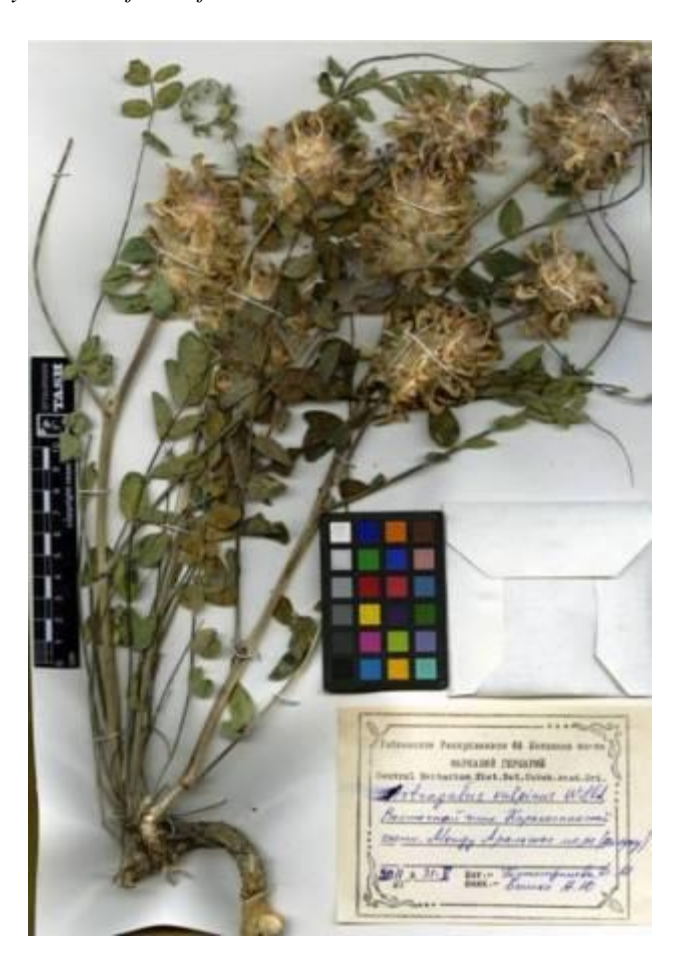
Fig. 2. Astragalus vulpinus Willd.

Centaurea apiculata Ledeb. Consp. Fl. Asia Med. 10: 411 (1993).