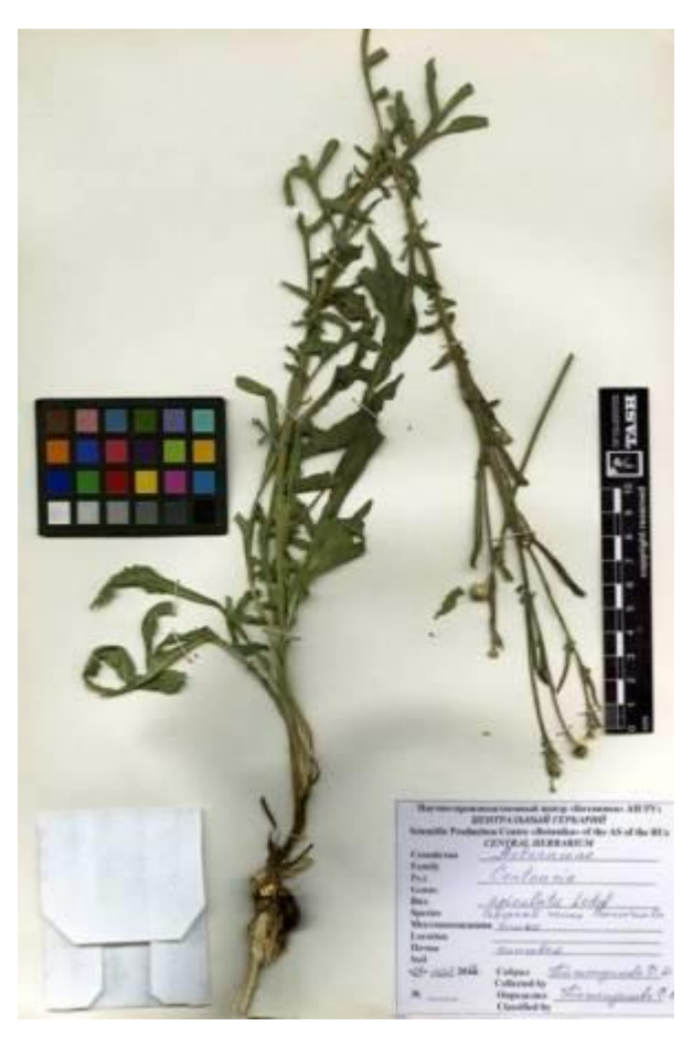
Fig. 3. Centaurea apiculata Ledeb.

Based on these collections from Ustyurt, Astragalus vulpinus Willd. and Centaurea apiculata Ledeb. are included in the list of flora Uzbekistan.