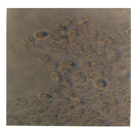
Figure 3: A431cells exposed ethanol extract D.salina (× 100)