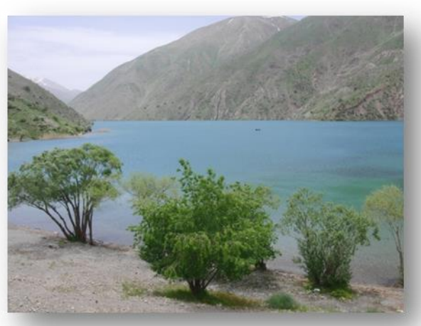
Figure 1: View of Gahar lake.

This research is the first report on Gahar Lake and Gahar River ichthyofauna and would contribute to the database required for conservation and sustainable utilization of Gahar Lake and Gahar River.