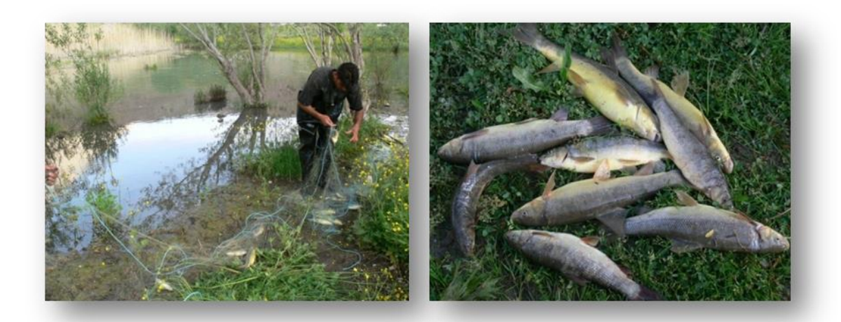
Figure 3: Catch of fishes by gill net.