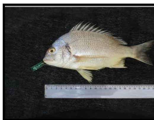
Figure 2: Acanthopagrus arabicus .

Collected species from 125 random stations were preserved in ice boxes and transferred to the laboratory for further biological measurements and otolith investigations. Identification and separation of genus and species of samples were done by using FAO keys (Fig. 2). Standard length of each specimen was measured to the nearest mm (Carpenter et al. , 1997; Iwatsuki, 2013).