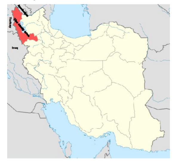
Figure 1. The map of Iran and location of the study area (the red area)

Study area and birds. The present study was conducted in West Azerbaijan Province, situated in northwest of Iran. The rainy winds of the Atlantic Ocean and Mediterranean strongly affect the climate of the area, resulting in abundant rainfall during the year, which can vary from around 900 mm in exposed southern areas to 300 mm in north (Figure 1). There are a large number of pigeon houses in West Azerbaijan Province that are handled traditionally. Five hundred and sixty pigeons consisting of 300 females and 260 males, kept in traditional systems, from different parts of the area were surveyed for the parasites between July 2015 and September 2016. The samples were classified into three age groups, including less than one month (nestling), 1-6 month(s) (adolescent), and more than 6 months (breeding) based on the owners' information.