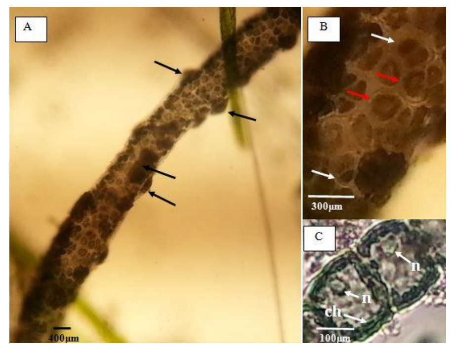
Fig. 3. A, B, Spine-like branchlets in cortical layer (cortex) which are composed of differentiated cells (black arrowheads); B, Polygonal cells (red arrowheads) and monosporangia (white arrowheads) in cortex; C, barrel-shaped cells in the place of growth of thallus. Each cell has one nucleus and parietal chloroplasts, which are small and dark green to greenish blue (white arrowhead). n=nucleus, ch= chloroplast