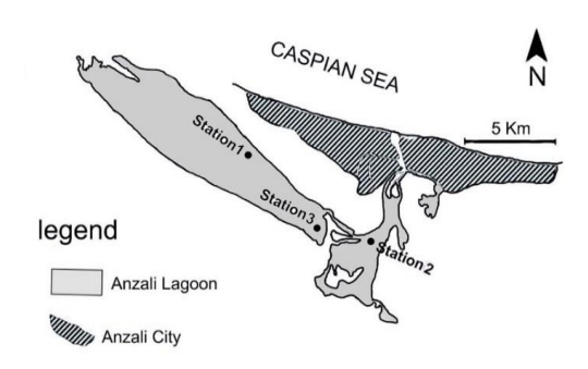
Figure 1: Location of the study area. Black circles are sampling sites.

Specimens of M. nipponense were collected from the three sites of the lagoon, namely Site 1 (Talab gharb) (37°27'9446.43"N and 49°22'9944.18"E), Site 2 (Siah (37°25'026.42"N darvishan) and 49°27'307.12"E) and site 3 (Sorkhankol) (37°25'2998.45"N and 49°24'6902.1"E) (Fig. 1), which is a preferred habitat for the species. A total of 10441 prawn specimens were sampled.