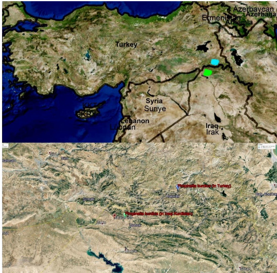
Fig. 1. Geographical distribution of Pimpinella kurdica in Turkey (blue) and in Kurdistan region of Iraq (green).

curved at the apex, hairy at the middle, c. 1 mm in diameter. Ovary ovoid, white pubescent; both mericarps mostly well-developed. Mature fruit oblong to broadly elliptic, 1.6-2 mm x 0.9-1.1 mm, pubescent, dark brown, with lateral and dorsal filiform and light brown ridges.