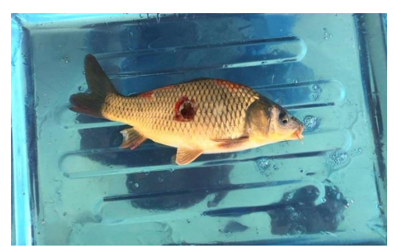
Figure 1: Ulcer and lesions on the skin of infected common carp.

First examination was done by viewing and observing for skin tissue change like ulcer and lesion formation on the skin, in mouth cavity and intestine, the result showed that out of 150 only 86 fish were infected with ulcer on their skin, only 6 fish had lesion around their mouth, and just 3 visceral organ lesions were present. The results are illustrated in Table 2.