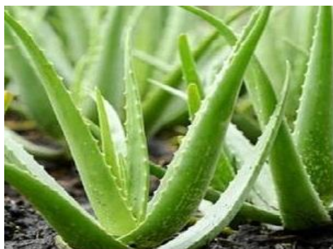
Fig. 1 Aloe vera

R. graveolens - (Fig. 2) is a species of Rutaceae family that has many properties such as anticancer, anti-inflammatory, antihypertensive, antimicrobial, antifungal, and antiparasitic properties. A variety of glycoside, coumarins, lignins, quinolone alkaloids, and flavonoids have been extracted from this plant with potential anti-inflammatory, antioxidant, antibacterial, and antifungal activities [16-18]. In this study, the effects of the above extracts and acyclovir at different concentrations were comparatively investigated on the virus directly and also on different stages of HSV-1 replication inside the cell.