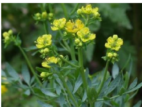
Fig. 2 Ruta graveolens L.