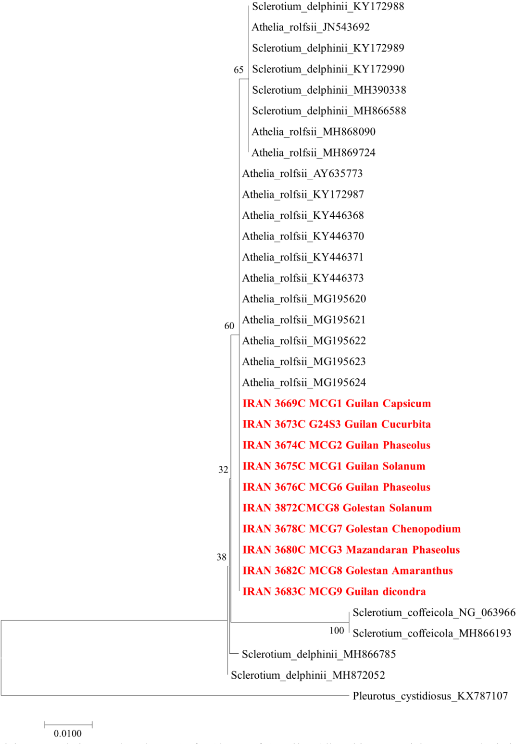
Fig. 1 Minimum Evolution tree based on LSU for 10 taxa of A. rolfsii . All positions containing gaps and missing data were eliminated. Evolutionary analyses were conducted in MEGA 7. Pleurotus cystidiosus was used as an outgroup taxon.

(Nm) were 0.258, 0.097, 0.623 and 0.303, respectively. Our analysis of molecular variance (AMOVA) revealed that the diversity between populations was relatively high (70%). Thirty percent of the observed variance corresponded to differences among isolates within populations (Table 4). The low variance observed in the isolates within populations indicates their high genetic relatedness. The highest genetic similarities were observed between the Guilan and Mazandaran populations (Table 5).