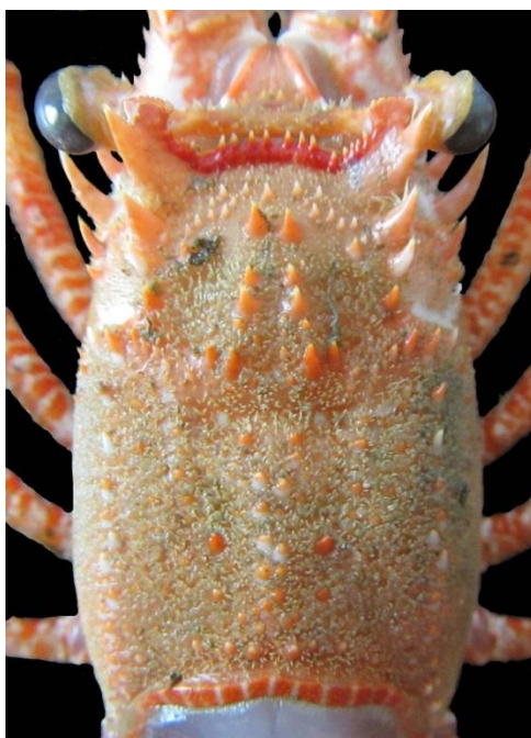
Figure 4: Dorsal view of carapace of P. waguensis from Oman.