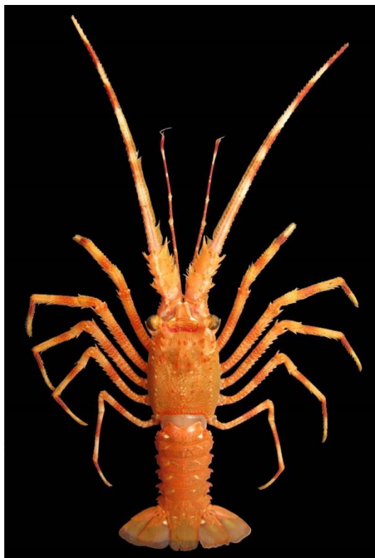
Figure 3: Palinustus waguensis , adult male, 43.1 mm CL, from the coastal waters of Oman.

Anterior margin of carapace between frontal horns bearing 5–7 spines (Fig. 4). Frontal horns truncated, with 5–7 distinct spines on inner margins. According to Holthuis (1991), the presence of several distinct spines on anterior margin of carapace as well as inner margin of the frontal horns are distinguished features of the species, while following Chan and Yu (1995) anterior margin of carapace between frontal horns provided with 0 to 8 spines and inner margin of supraorbital horn armed with 0–5 spines. Epistome armed with 3 to 5 spinules on the anteromedian margin. Antennal peduncle armed with many spines with one distinctly long spine on distal part. Carapace was heavily pubescent with rows of regular spines along lateral edges. Postorbital spine is shorter than