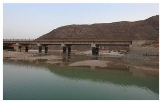
Figure 2: Study area in Tang-e-Khor River (Hormuzgan Province) (Left: view to south, Right: view to north)