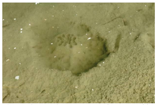
Figure 3: Nesting pattern of Iranocichla hormuzensis males on shallow bed margin of Tang-e-Khor River (Hormuzgan Province)

zigzag and were oblique) to attract females and specimens of females (in light color) were also seen around.