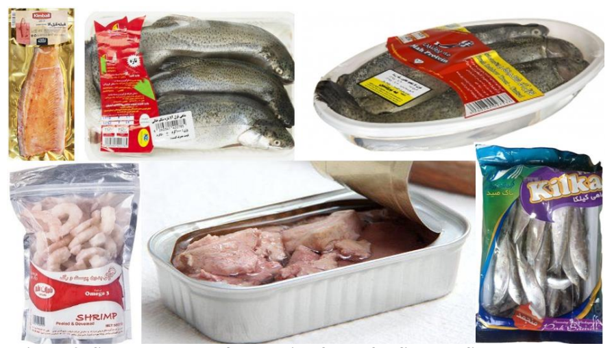
Figure 3: Some examples of packaging forms for fish and fishery products.

coefficient of 0.15) and shape and form (with effect coefficient of 0.11) of fishery products packaging were in next of influence, respectively. Probably due to effect size and weight of packaging of fishery products on price, it may affect the consumers and buyers' attitude toward packaging. The first priority of people to buy packaged shrimp was 250 to 500 grams (Reyhani Poul et al., 2019b). The choice of size of fishery products by the people depends on the household population, type of product and amount of income. The packaging material of fish and fishery products affects the consumers and buvers' attitude toward packaging, probably due to hygiene issues. The proper shape and form of packaging leads to attractiveness of the product and probably for this reason it affects consumers and buyers' attitude toward packaging. Fig. 3 shows some examples of packaging forms and shapes for fish and fishery products.