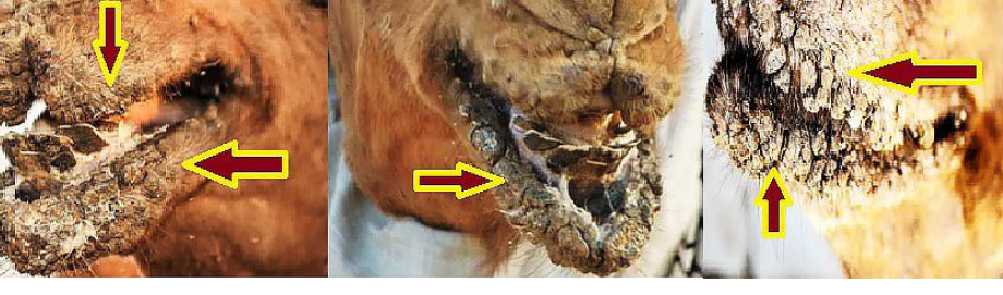
Figure 1. Camel Orf clinical presentations on lips

The outbreaks of CCE in camel herds have occurred in different parts of Wasit province. All 210 examined animals (aged 6 months to 4 years) were severely injured. The clinical findings in infected camels included severe papules on their lips and legs, increased body temperature, copious salivation, foulmouthed odor, and facial edema (Figure 1).