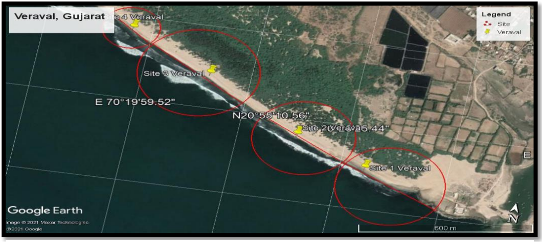
Fig.1. Map of the study area, showing the intertidal area of the Veraval Coast.