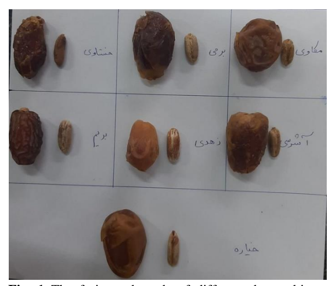
Fig. 1 The fruits and seeds of different date cultivars studied in this experiment.

This research was conducted on 7 date cultivars 'Mekawi', 'Khastawi', 'Khyara', 'Zahdi', 'Ashrasi', 'Barhi' and 'Bream' which were collected from an orchard located in Basra city in Iraq (Fig. 1). At least 30 uniform and healthy fruits from each date cultivar were selected and the seeds were separated from the fruits. To completely remove the flesh of the fruit, the seeds were washed with distilled water and kept at ambient (laboratory) temperature for several hours. Then the samples were dried in an electric oven at a temperature of 50 °C for 24 h. The dried seeds were stored in separate plastic bags in the refrigerator.