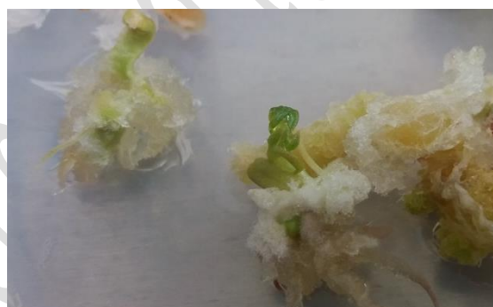
Fig. 4 Calligraphy and microenvironment regeneration in hypocotyl of 0.5 mg.L -1 NAA.