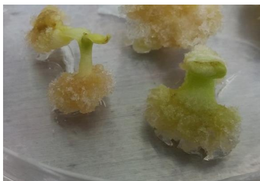
Fig. 5 Calligraphy and regeneration of fetal explanted related to the interaction between NAA and microbial samples at concentrations of 0.5 mg.L -1 .