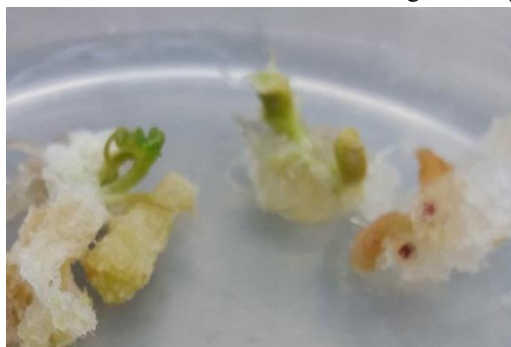
Fig. 3 Calligraphy and regeneration of leaf explants. Interaction between BAP and Leaf Sample at 0.5 mg.L -1 .

Means of column followed with the same letter are not significantly different ( P \leq 0.01 ).