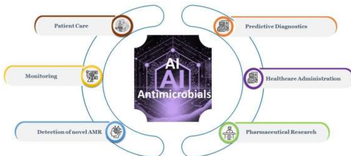
Figure 1. AI can be applied on antimicrobials to obtain different objectives such as Patient care, Pharmaceutical Research, monitoring, Detection of novel AMR etc. (Image Credit: Corresponding author).

The model yields impressive mean area under the curve (AUC) values of 0.99 and 0.82 for receiver operating characteristic curves, underscoring its robust predictive capability. Moreover, the results suggested the model could predict occurrences several hours in advance with minimal loss of accuracy (30). The advantages of AI in analyzing a wide range of images, include whole-genome sequences (WGS) of bacteria, macroscopic or microscopic images, and MALDI-TOF mass spectra. AI is progressively finding utility in clinical microbiology, enhancing the diagnostic capabilities of laboratory personnel. As AI technology continues to progress, more refined and reliable AI software assessments are expected to emerge, facilitating the seamless integration of AI into clinical microbiology laboratory workflows.