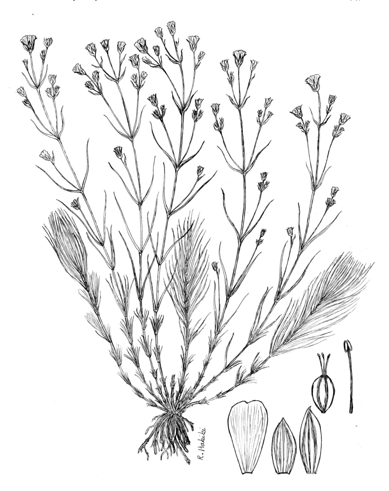
Fig. 3. Arenaria longibracteata ( \times 0.66); sepals and petal ( \times 3.3.); stamen and ovary ( \times 6.6).